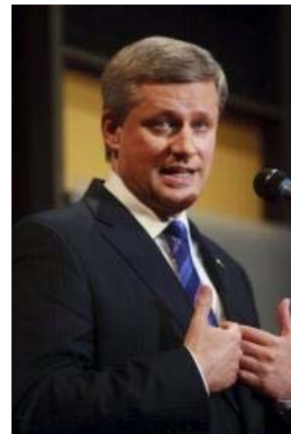
Prime Minister Stephen Harper