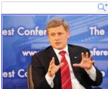
Canadian Prime Minister Stephen Harper