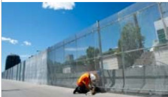
A construction worker puts up a three metre high steel security fence outside the Toronto Metro Convention Centre for the upcoming Toronto G20 summit in Toronto on Tuesday, June 8, 2010.