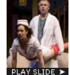
PLAY SLIDE ▶ Pictures of the Week Jan 17-23

ANNOUNCEMENTS: Obituaries | Births | Cards | InMemoriams | Milestones