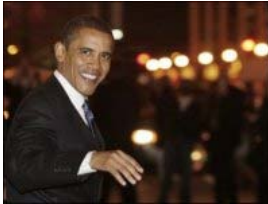
President Barack Obama has been able to set out an agenda to 'bring change to America.' Why can't our leaders?

In the election campaign, at his inauguration and in these first few days of his presidency, Obama has been able to set out an agenda to "bring change to America."