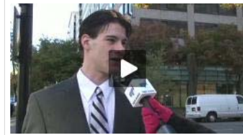
Fear and the election Monday, October 20