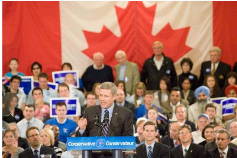
Federal Conservative leader Prime Minister Stephen Harper speaks to supporters in Vancouver, British Columbia, during a federal election campaign stop October 8, 2008.

OTTAWA, Oct. 9 (UPI) -- Party allegiance has taken a back seat to economic concerns among Canadian voters less than a week away from an election, a poll published Thursday indicated.